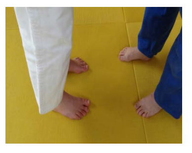
3: starting position - correct