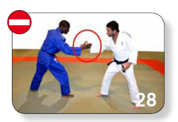
Remarks: At the beginning and the end of the contest the fighters is not allowed to make religious acts, gestures or signs on the tatami.

The contestants must not shake hands BEFORE the start of the contest. (28).