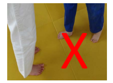
2: starting position - not correct