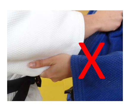
6: starting position - grip not correct