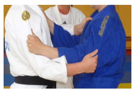
4: starting position – grip correct